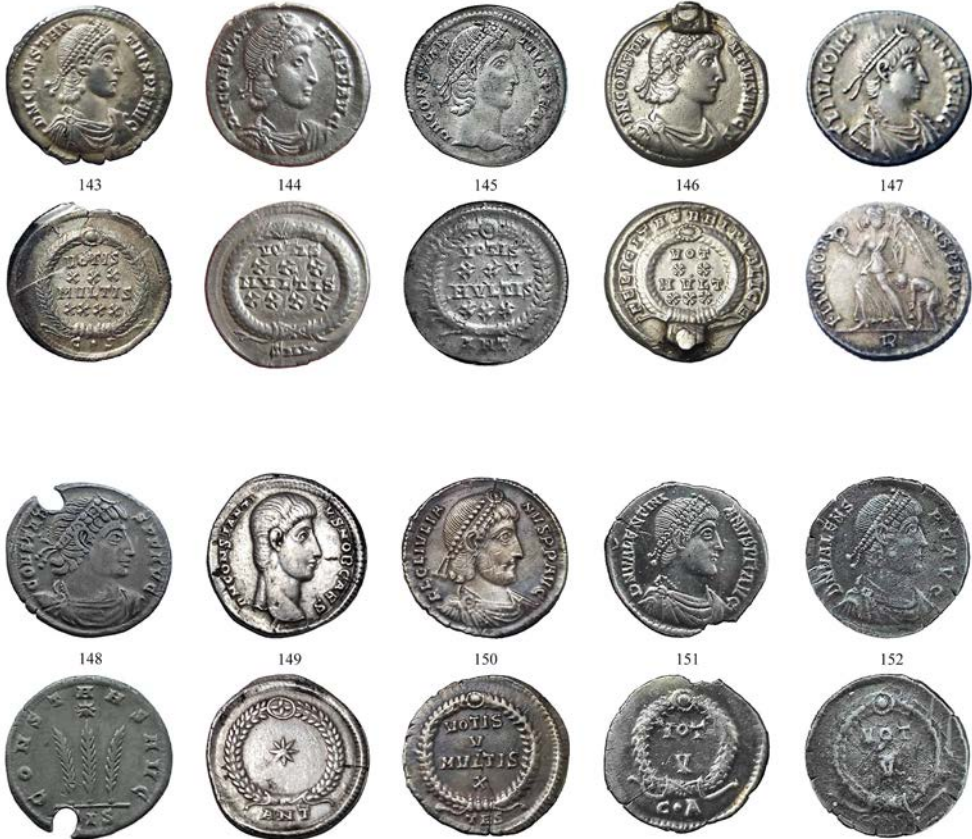
Pl. III. Single finds of siliqua coins of Constantius II (nos. 143-6), Constans I (nos. 147-8), Constantius Gallus (no. 149), Julian the Apostate (no. 150), Valentinian I (no. 151), Valens (no. 152) attested on the territory of the Republic of Moldova.