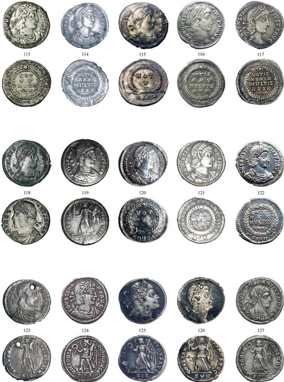
Pl. I. Single finds of siliqua coins of Constantius II (nos. 113-4, 116-7, 121-2, 125-7), Constans I (nos. 119, 124), Vetrantio (no. 123), Valentinian I (no. 120), Valens (nos. 115, 118) attested on the territory of the Republic of Moldova.