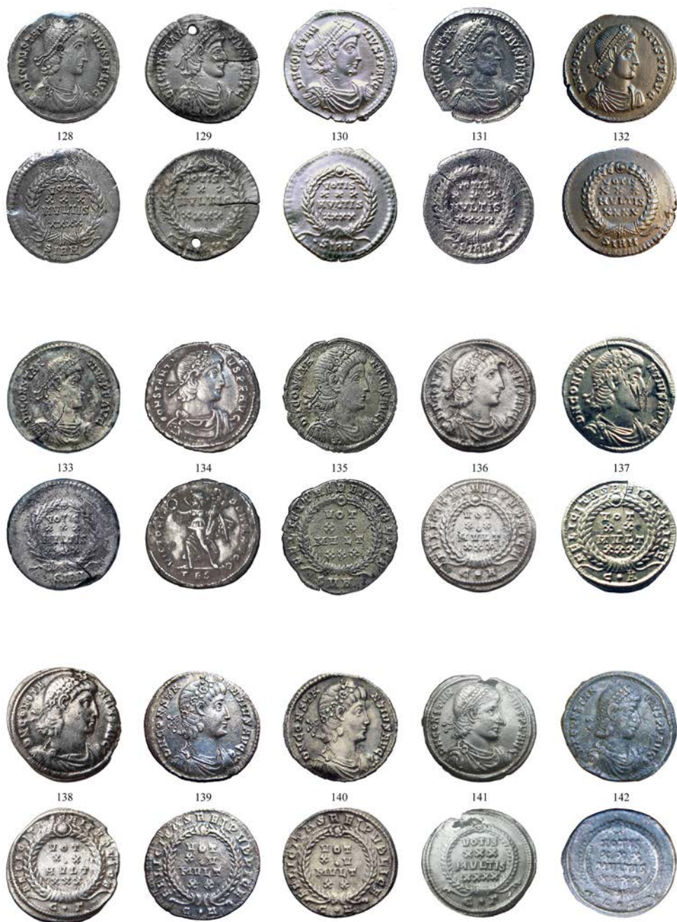
Pl. II. Single finds of siliqua coins of Constantius II (nos. 128-42) attested on the territory of the Republic of Moldova.