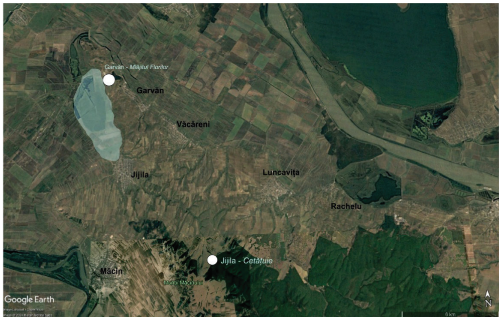
Fig. 2. Geographical location of the analysed sites: Garvăn-Mlăjițul Florilor and Jijila-Cetățuie.