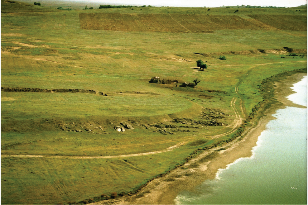
Fig. 3. Garvăn-Mlăjitul Florilor : aerial view from the west (2007).