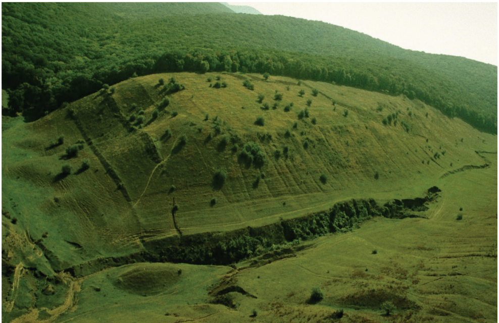
Fig. 4. Jijila-Cetățuie : aerial view from the northwest (2007).