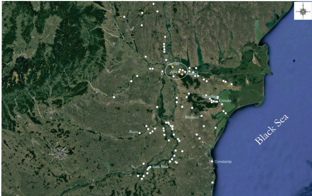
Fig. 1. Location of sites attributed to the Babadag culture.