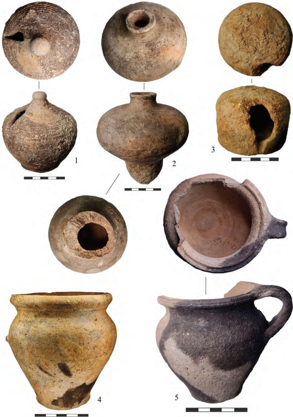
Fig. 9. 1–5 Mediaeval clay vessels discovered in excavation 2, Cx. 94/96/108 (after BILAVSCHI, BACUMENCO-PÎRNĂU 2023, pl. XXIII).