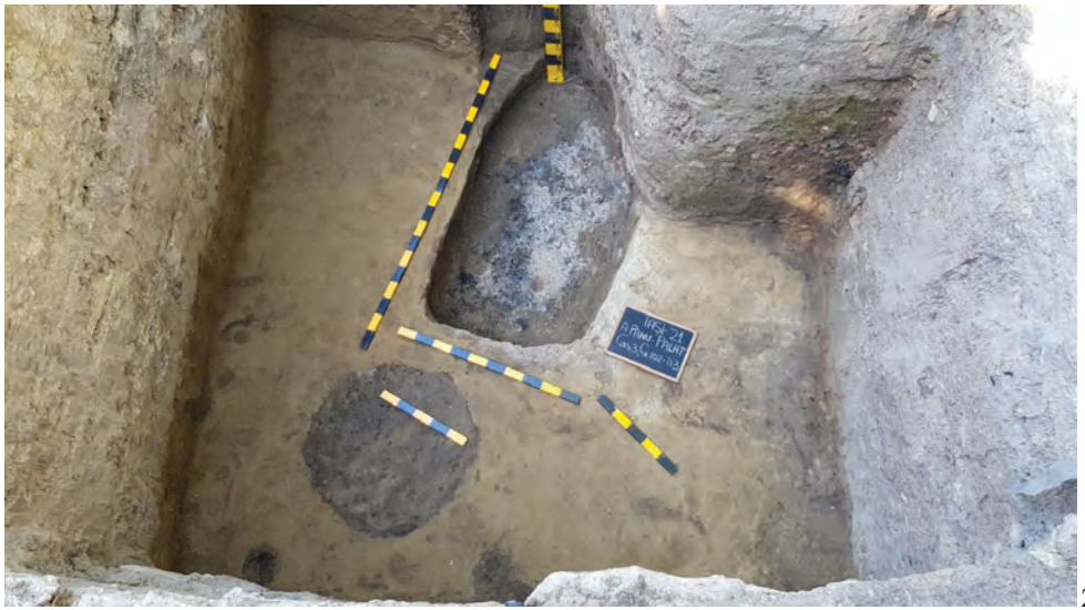
Fig. 6. 1-2 Images of the finds in excavation 3, features Cx. 94-102 (stages of research).