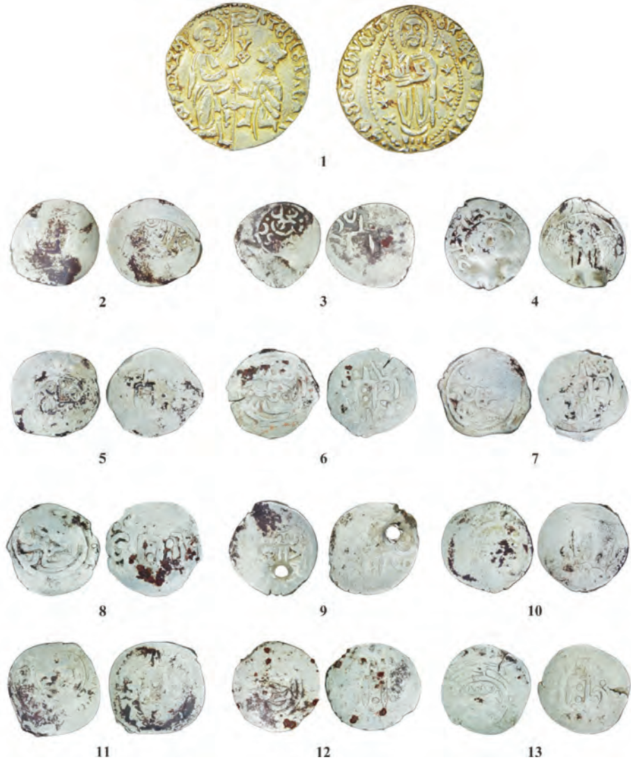
Fig. 7. 1 – Imitation of Venetian ducat; 2 – Genoese-Tartar akçe. 3 – Dirhems issued by the khans of the Great Hoard, Crimean Khanate (all discovered in Cx. 94/96/108).