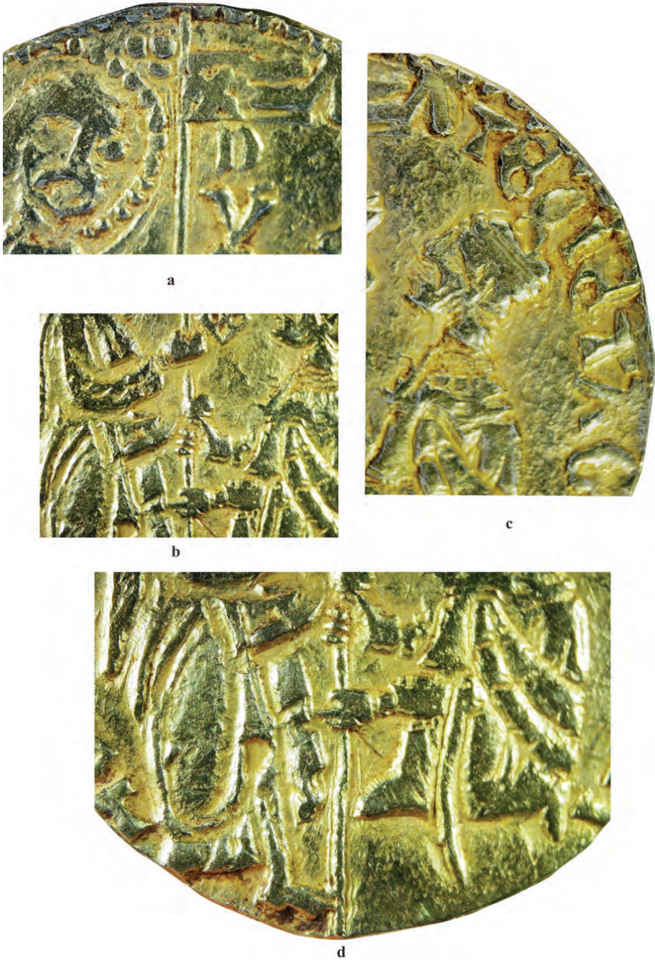
Fig. 8. a-d Details on the imitation of Venetian ducat (obverse): a – Three dots mark; b – Stylized representations; c – Ineligible legend details (fragment); d – Lack of mark under kneeling Doge.