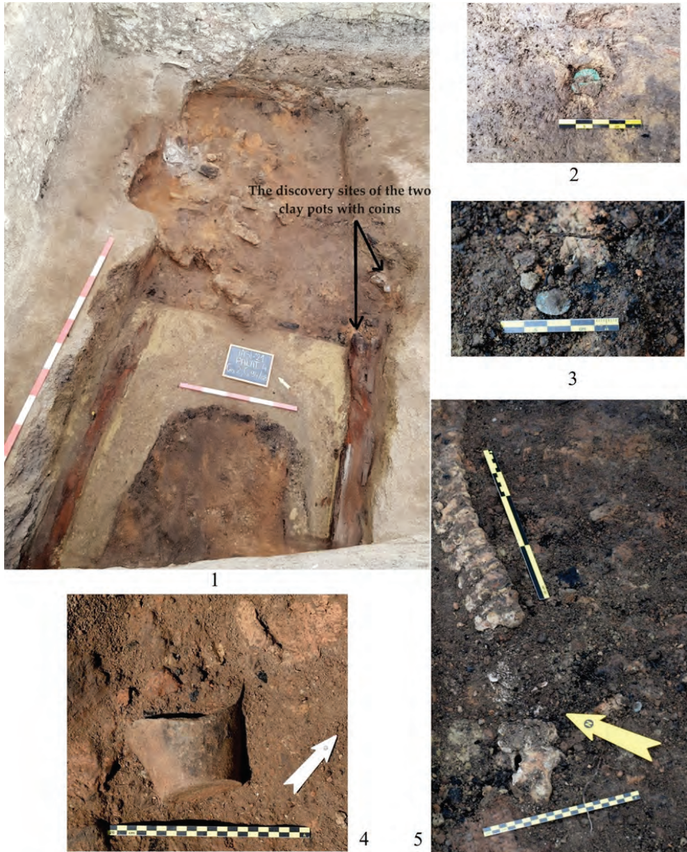
Fig. 4. 1 – Habitation feature (Cx. 94/96/108) (detail); 2–5 Archaeological materials discovered in situ .