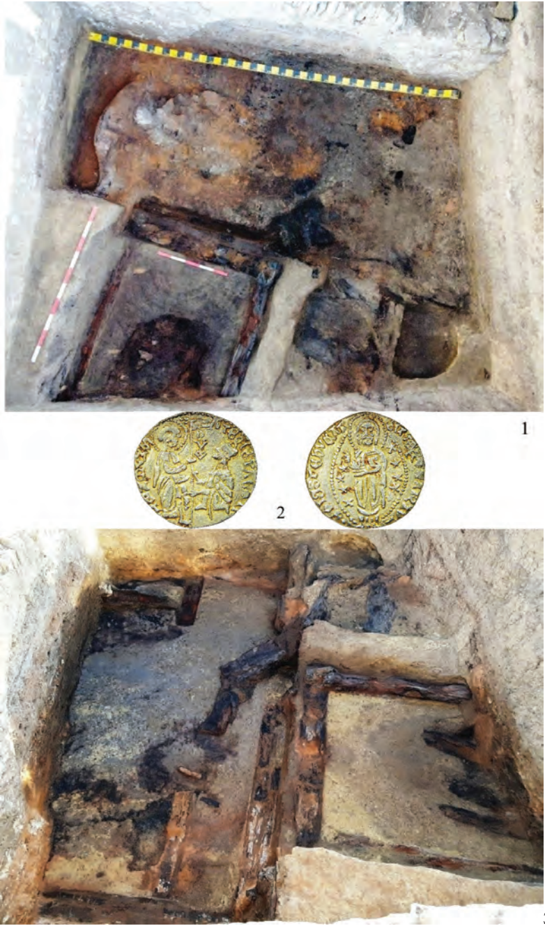
Fig. 5. 1, 3 – Habitation feature (Cx. 94/96/108) in final stage of research; 2 – Imitation of Venetian ducat uncovered in situ (after BILAVSCHI, BACUMENCO-PÎRNĂU 2023, pl. IX).