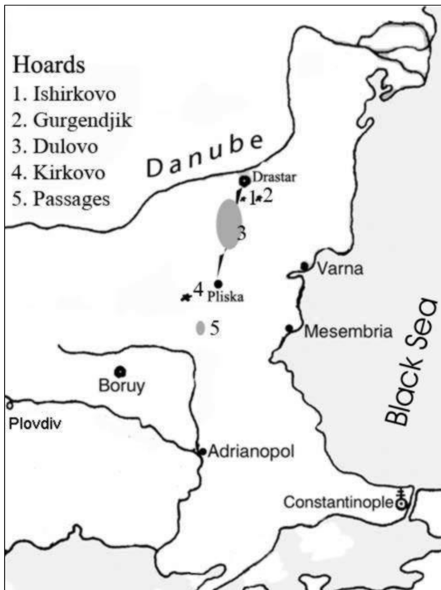
Map. Coin hoards which could be connected to retreat of the Byzantine army.