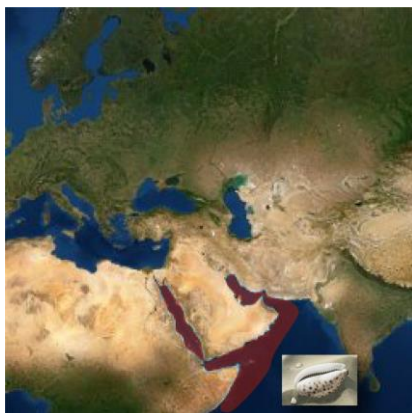
Fig. 3 - Distribution of the Cypraea pantherina snail shells before the 19 th century.