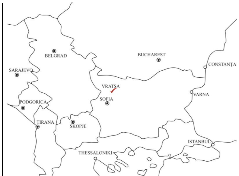
Fig. 1 - Location of the city of Vratsa, NW Bulgaria.