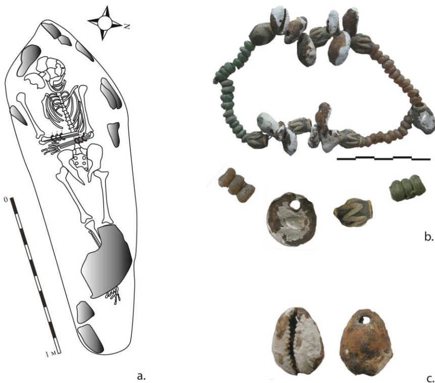
Fig. 2 - a. Grave no. 27, medieval necropolis in Vratsa; b. Multi-component necklace; c. Cypraea pantherina snail shells.