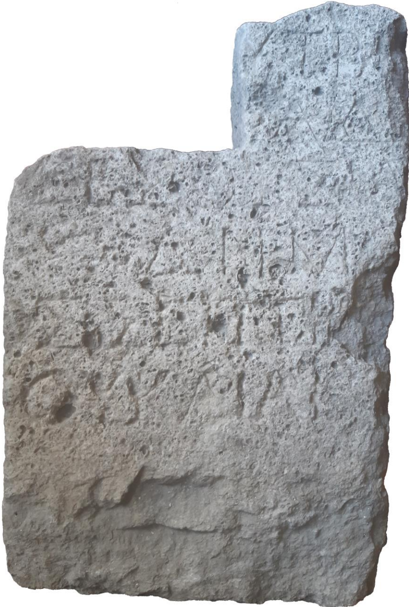
Fig. 6. Imperial dedication to Hadrian from Tomis.