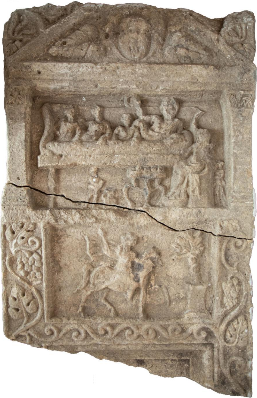
Fig. 5. Funerary stele from Istros: the upper half of ISM I 303.