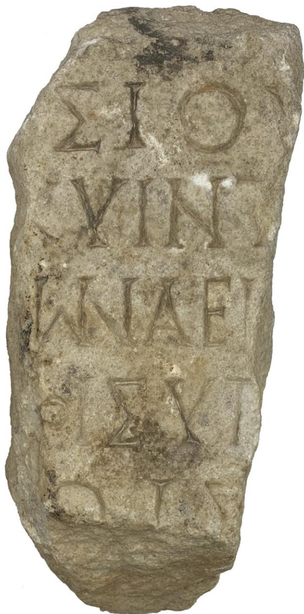
Fig. 7. Inscription of uncertain character from Tomis.