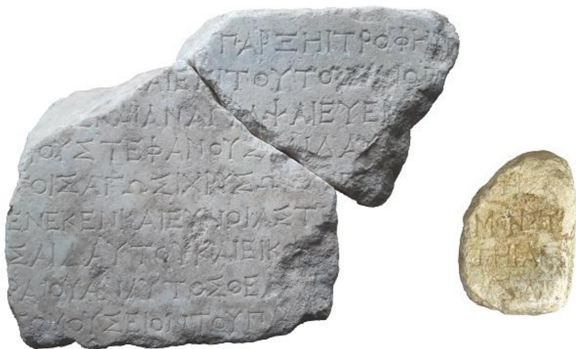
Fig. 2. The decree for Diogenes, son of Diogenes, ISM 2+3 + a new fragment.